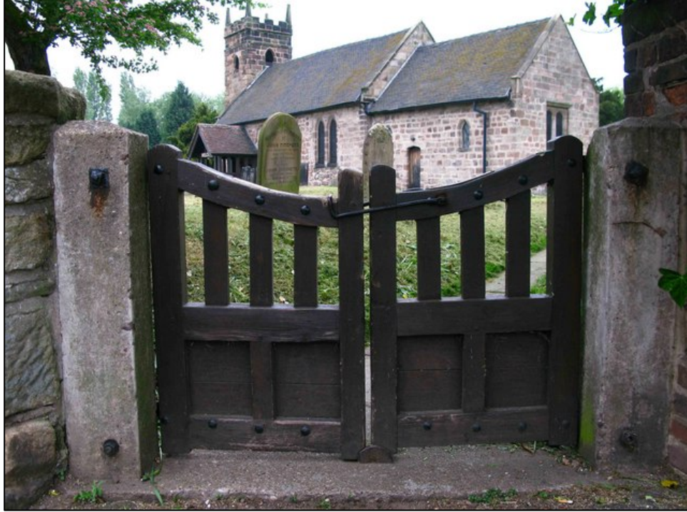
St. Michael's Church, Willington.

Services are held on Sunday at 8:00 am and 10:00 am.