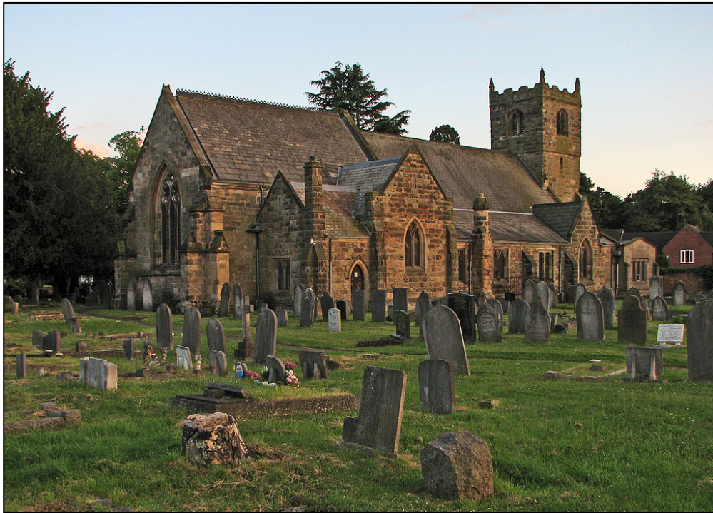
All Saints, Mickleover Cemetery.

Services: Holy Communion can be attended from 9:15 a.m.–10:15 a.m. on Sundays, with Family Worship at 11:15 a.m. If preferred, evening worship services are held at 6:30 p.m.