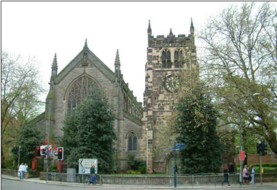
Derby St. Werburgh Church.